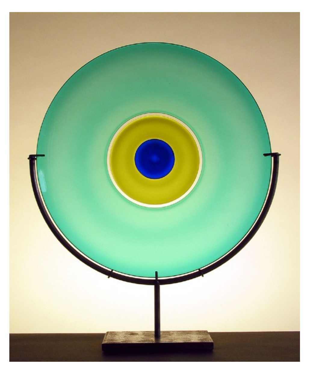
Platter on steel stand, 20" diameter

Dimitri will be having a sale of mostly Athenian Design works —some higher end work will be available as well. Athenian design works start at about 18 dollars for drinking vessels ranging up to the hundreds for more involved pieces. The emphasis for this work is affordable glass for the home. Each piece is completely hand blown and hand formed -no molds of any kind are used at any stage in the process