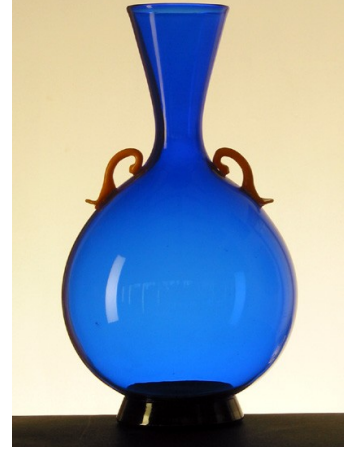
Blue vase, 8" height