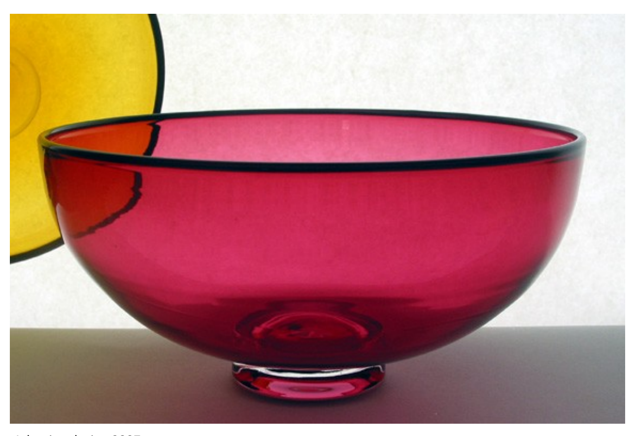
Athenian design 2007